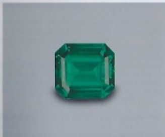
This image is for representational purposes only and is not necessarily actual color or size.