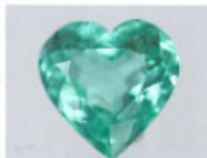
Imagen aproximada / Image is approximate