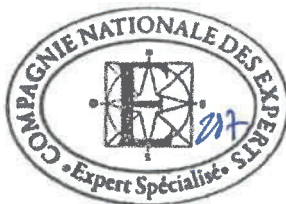
O. Bachet, Expert CNE, SNA, IAJA